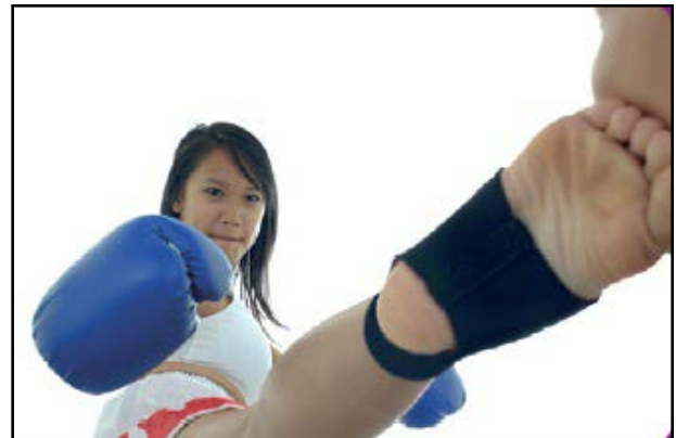
The women engage in daily exercise such as kick-boxing, yoga, Pilates, and self-defense.

Finally, we encourage the women to overcome their past and rebuild their lives through therapeutic activities such as exercise and gardening. Arya Tara offers daily exercise activities for women to work on relaxation and physical strength. Furthermore, the women are encouraged to pursue creative hobbies such as gardening. Arya Tara has a relatively large garden that is cultivated by the women and provides approximately 30% of the food that Arya Tara serves. The contribution of food from the Arya Tara garden instills a sense of pride in the women. At Arya Tara, we believe in the holistic health of the mind-body-spirit. Engaging in therapeutic activities such as yoga and gardening helps the women find inner-peace and integrate an active lifestyle into their everyday lives. We hope that these women adopt an active lifestyle and will continue these healthy habits upon their reintegration into society.