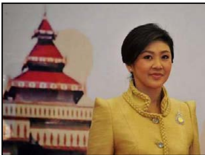
Some Arya Tara women choose to pursue higher education.

In addition, we contact their family to determine what kind of environment the woman or girl would be living in if they returned home. Other organizations such as the Somaly Mam Foundation have found this to be a key factor in determining the success of a woman's reintegration in society. Sometimes, in cases of extreme poverty, family members will, once