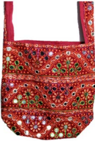
Sample Tara Bag

ue our efforts to stop the exploitation of women and girls, people have to understand the physical, mental, and emotional abuse sex workers experience. Thus, each bag contains a patch that has the name of the woman who created it. The buyer of the bag can type in the creator's name into our database and will find the biography of the woman who created it, allowing him/her to feel connected to the bag's creator and sympathize with the emotions that are wrapped into the bag's essence. Furthermore, the color of each bag represents a different virtue that is reminiscent of the woman who made the bag. See Public Relations section 5.5 for a more detailed description of each virtue color and the meaning behind Arya Tara.