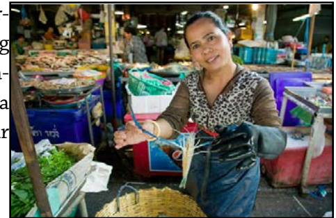
This Arya Tara woman has started her own business selling goods at the local market.

After the women complete the two-year program, they are encouraged to pursue a professional career. This career may be anything from working as a seamstress or a taxi cab driver, to an administrative assistant or on to higher education. Our ground crew in Pattaya works with local businesses and schools to find job positions for our women to earn a living.